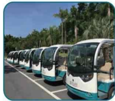
Xiamen BRICS Summit