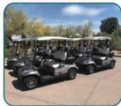
Lvtong Golf Cart in USA