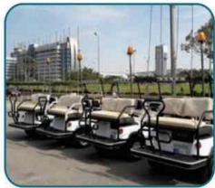
Cairo international airport, Egypt