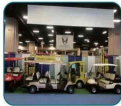
Golf Exhibition in USA 2015