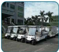
Electric Golf Cart with Solar Panels