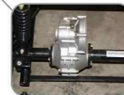
Transaxle Continuously variable transaxle no noise