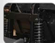
Shock absorber Adopting automobile steering system design, independent suspension system