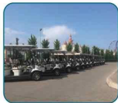
Lvtong Golf Cart in Russia