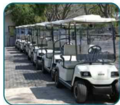
Lvtong Golf Cart in Malaysia