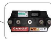
Controller Toyota AC Controller