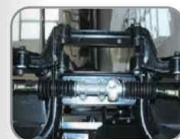
Suspension system Independent shock absorber Make people more comfortable