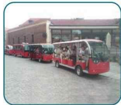
Lvtong Sightseeing Bus in Poland