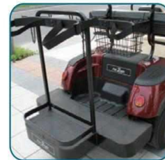
Golf Bag Attachment