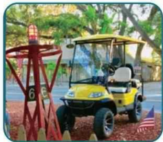
Lvtong Lifted Cart in USA