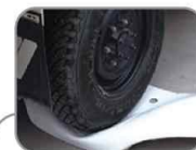
Cowl Graceful, unique, could suffer 40-ton truck rolling