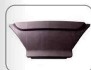
Bumper strong enhancement bumper is the best choice for collision absorption.