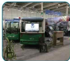
Lvtong Cart in Iran Exhibition