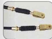
Braking cables Lvtong unique brake cable is protected by rubber cover. There is rubber seal inside preventing from dust and water.