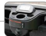
Dashboard Convenient for operation, Humanized design concept