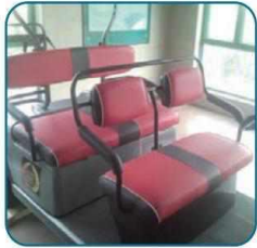
Artificial Seat Cushion