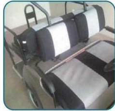
Fabric Seat Cushion