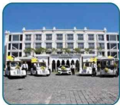
Lvtong Classic Cart in Vietnam