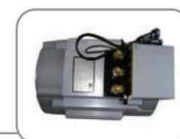
AC Motor 4 KW output, strong torque, stable performance, high temperature resistant, good sealing performance.