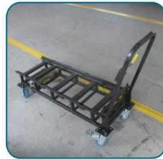
Push-pull type battery loading and unloading frame