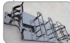
Chassis High tensile steel welding structure, electrophoresis treatment for the whole chassis enhances the anti-corrosive and anti-rust performance