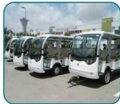
Lvtong Sightseeing Bus in Turkey