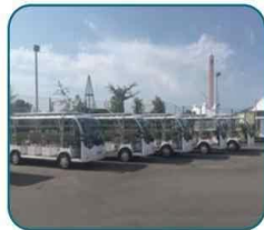
Lvtong Sightseeing Bus with Solar panets