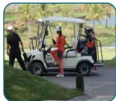
Indoneisa Golf Course