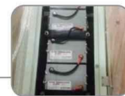
Battery Maintenance Free Battery