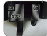
Pedals Integrating acceleration, brake and parking together. Braking distance is adjustable.